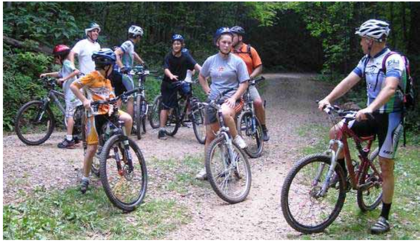
Youth learn new skills while keeping fit with mountain biking.