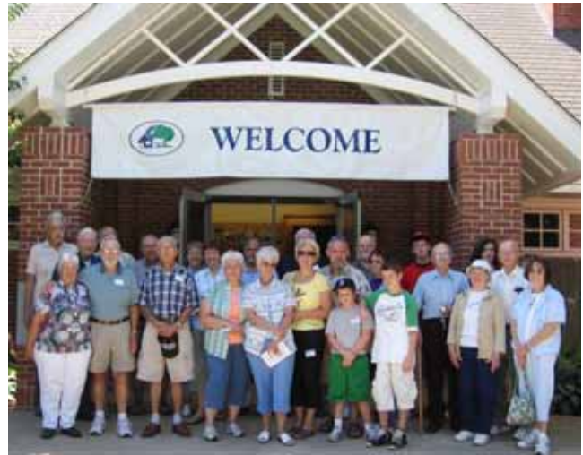
Alumni ranged from youth who have been at the Home in recent years to those who were residents in the 40s, 50s and 60s.