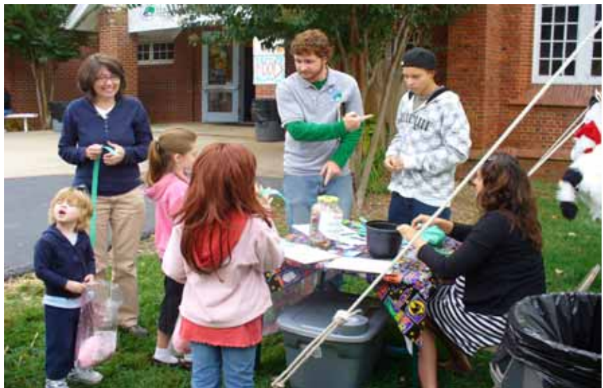
Staff, youth and volunteers enjoy music, food, games and a silent auction each year at PHFC's annual Fall Festival. The fundraising goal for 2009 is $10,000.

Visitors will also have a chance to see renovations volun-