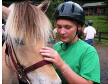
Brandy experienced riding.

Youth were able to see the inside of a private jet in addition to hearing a private pilot share the educational requirements for becoming a pilot, what activities would assist a hopeful young